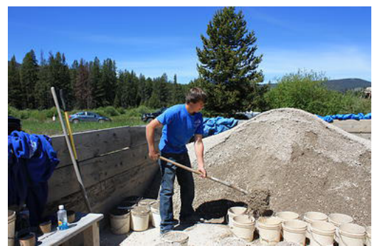
Gravel containing Sapphires

Gem Mountain in Montana was first developed in the 1890's and has since produced more than 180 million carats of sapphires! Sapphires are some of the rarest gemstones in the world, but not here. Gem Mountain in Montana is the source for every known color of sapphire and some colors found nowhere else. When heat treated and faceted they have a brilliance that can't be beat by gems from anywhere else in the world.