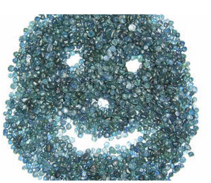
Sapphire High Grade