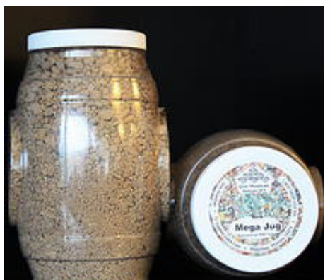
Gravel As Shipped