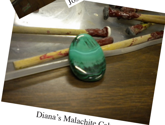
Diana's Malachite Cab