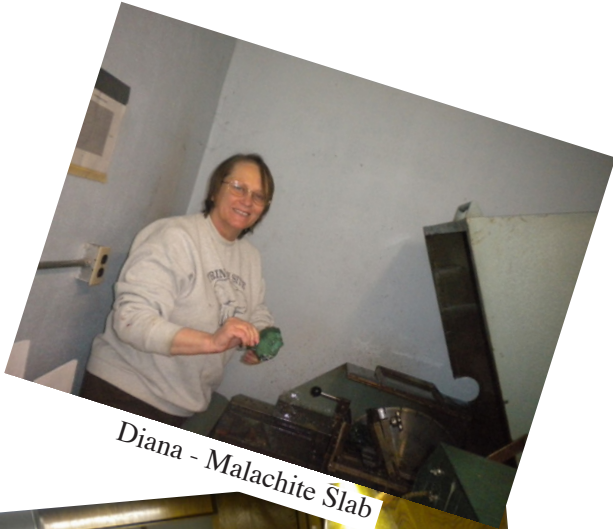
Diana - Malachite Slab