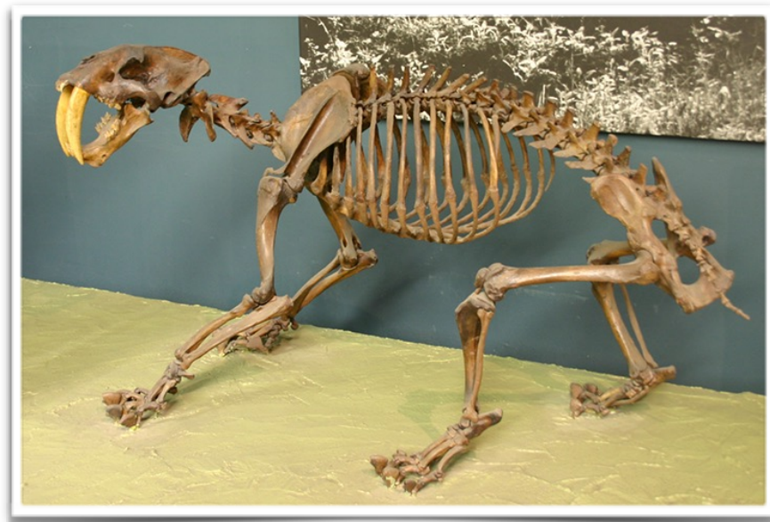
Smilodon fatalis , Smithsonian Museum

In early textbooks, encyclopedias, coloring books and other books the fossil was listed as a Saber-toothed Tiger, it was NOT a Tiger, but it did belong to the Cat family, most books have corrected this information.