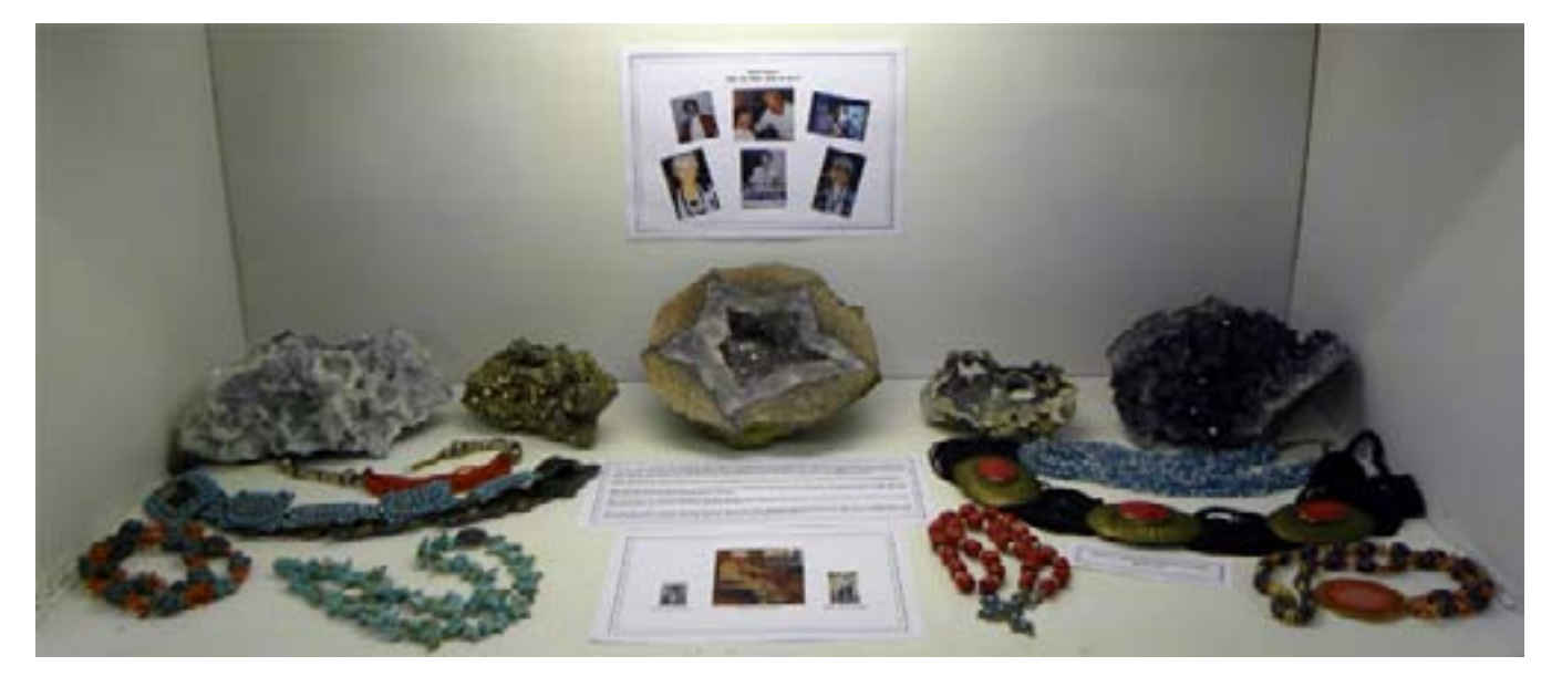
Ellen Placas Dec. 18, 1920 - July 16, 2010

As you can tell by this display Ellen liked everything she collected to be BIG. A couple of her mineral specimens are large enough that just one of them would fill this case with very little room for anything else. When you look at several of these photos you also see that she even liked BIG jewelry.