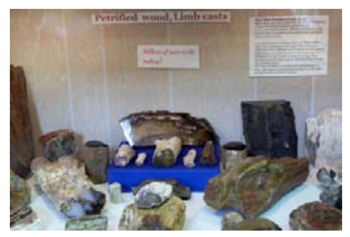
Al Hess - Petrified Wood