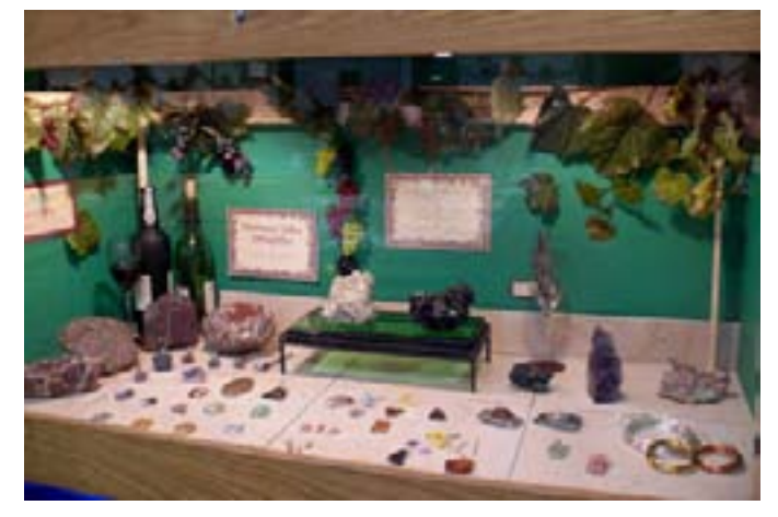
Diane Day - Lithophiles County Fair Case