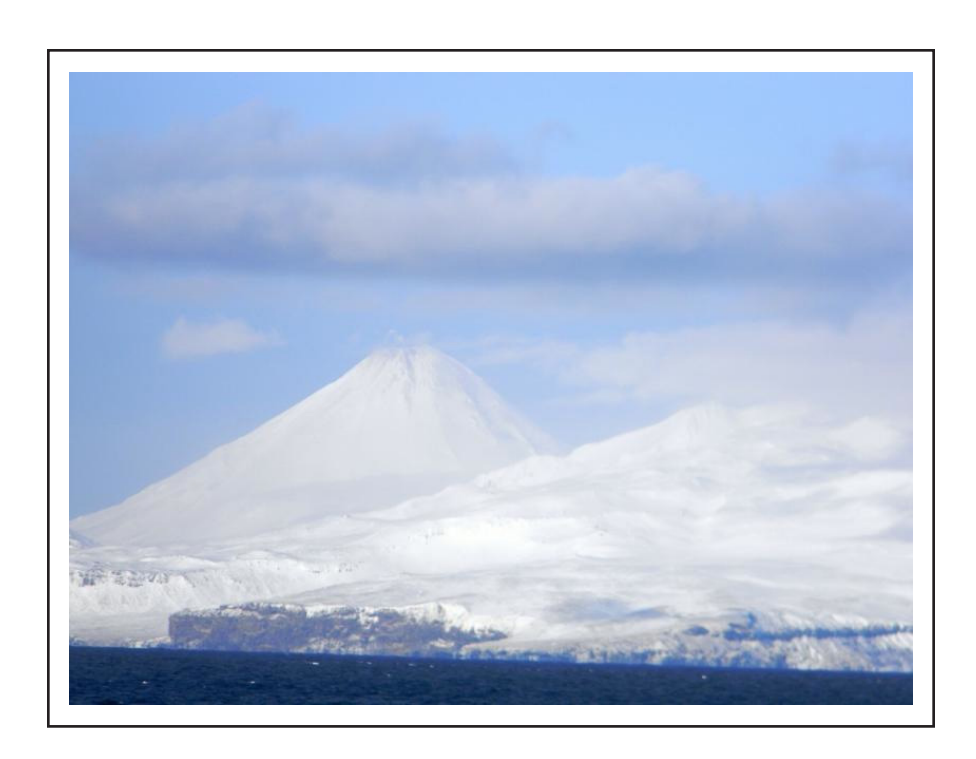
Carlisle - Alaska Aleutian Islands Last Eruption - 1828 5,315 feet 52.894° N 170.054° W