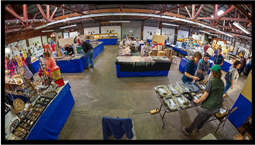
Overall View of Show