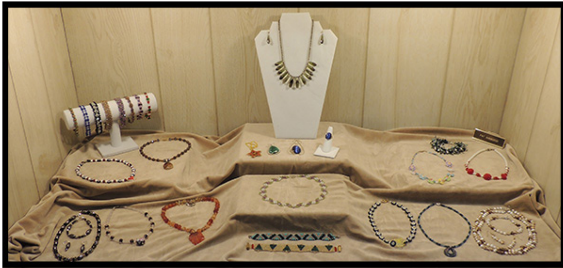
Pat Iannucci's Beading Display