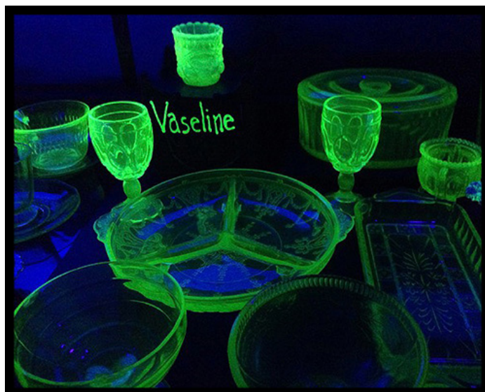
Stephanie Goldsmith's Uranium Glass Display