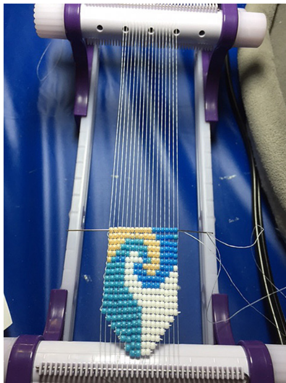
Beading Project on Beading Loom