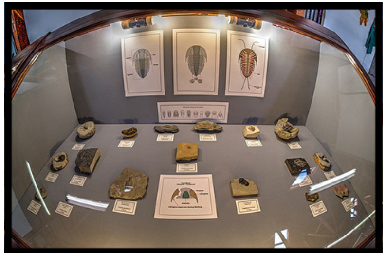
Bill Beiriger's Trilobite Display