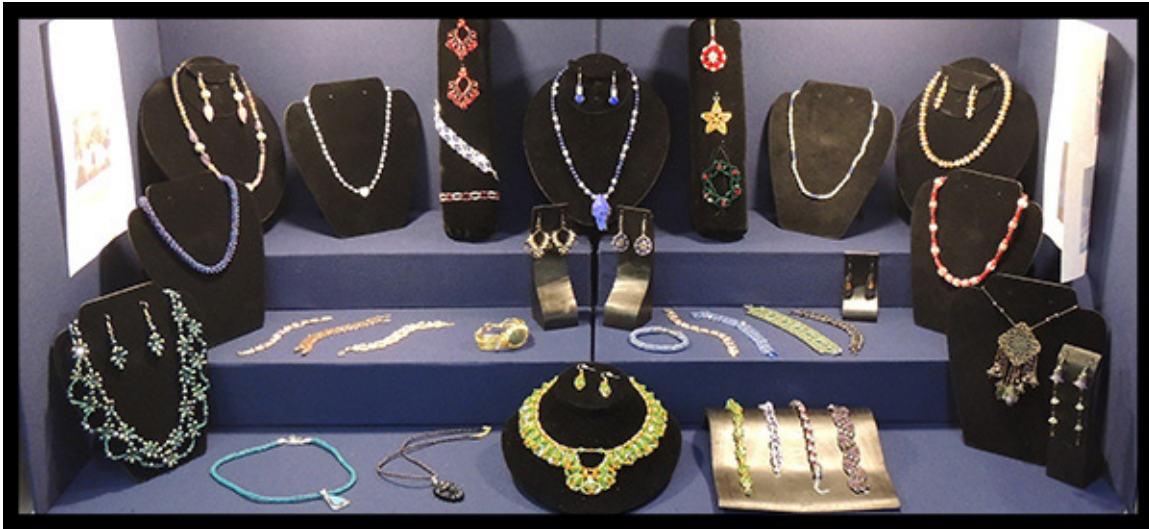
Beading Buddies Display