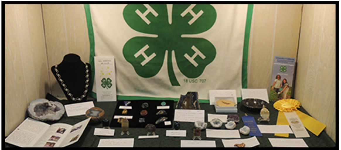
4-H Members Display