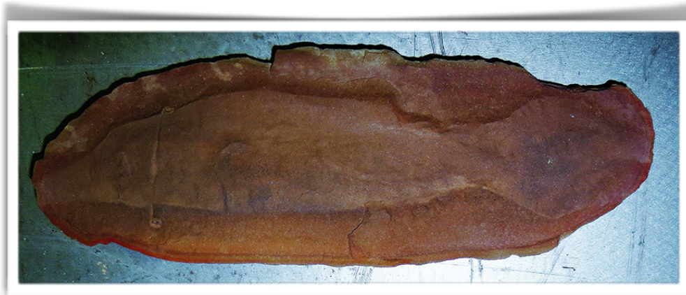
Specimen from the Milano Museum

It became the Illinois State Fossil in 1989.