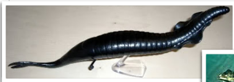
Tully Monster Model – on plastic stand