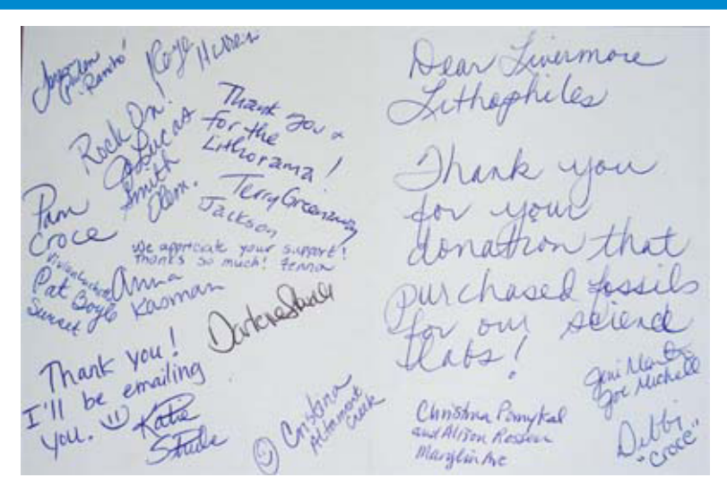
Thank you card from Livermore School Science Teachers for money from LITHORAMA Crystal Project