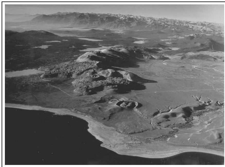
Mono Craters - California Last Eruption - 1350 +/- 20 years 9173 feet 37.88° N 119.00° W

Information and Photos from the Global Volcanism Program - Smithsonian Institution.