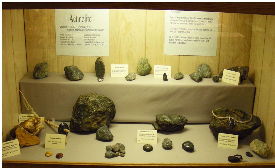
Beth & Ernie Meyers Actinolite Display - LITHORAMA 2008