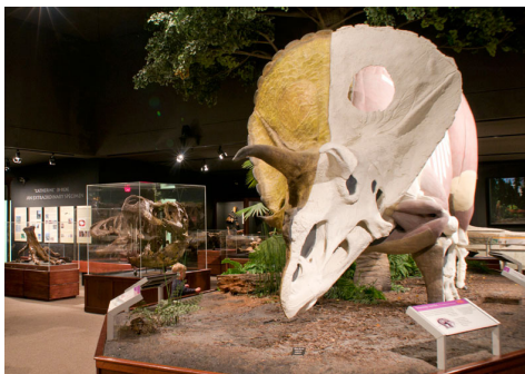
Triceratops Model Showing Bones, Muscles and Skin