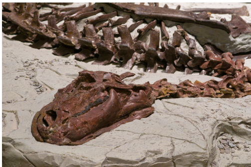
Dinosaur in Matrix