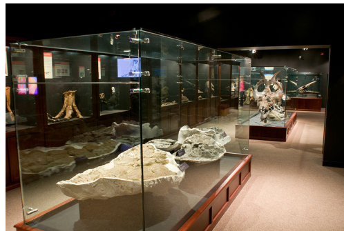
Fossils in Transport Plaster