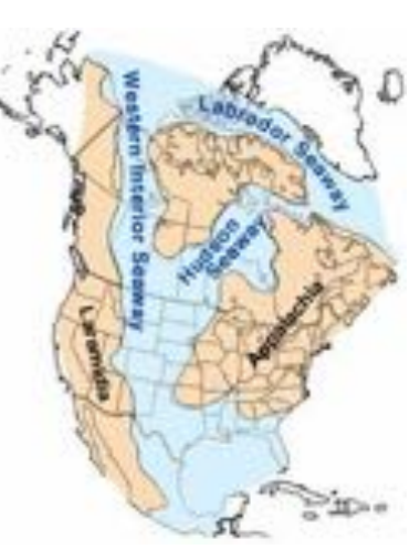
Inland seas 100 mya

Tylosaurus and Pteranodon became the Kansas State Fossils in 2014.