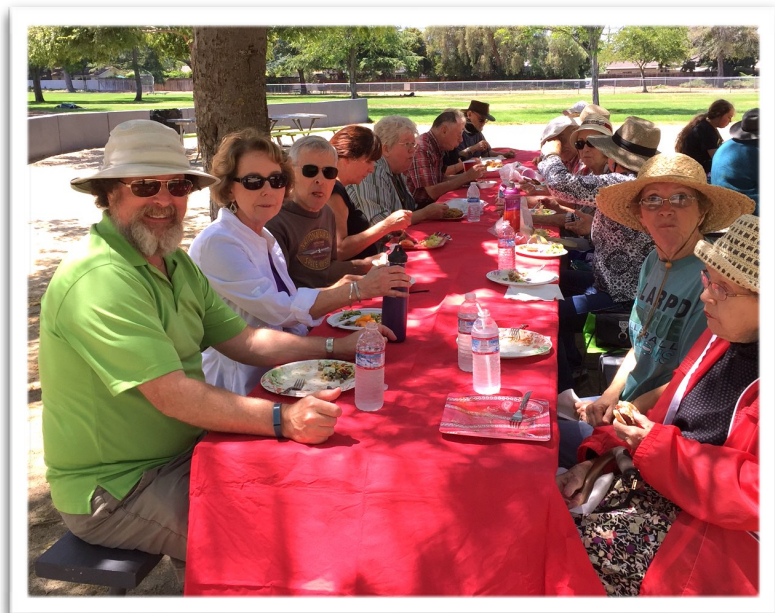
Photo from last year's picnic.