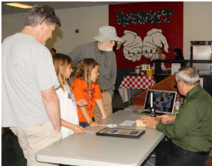
Insect Science Museum of California