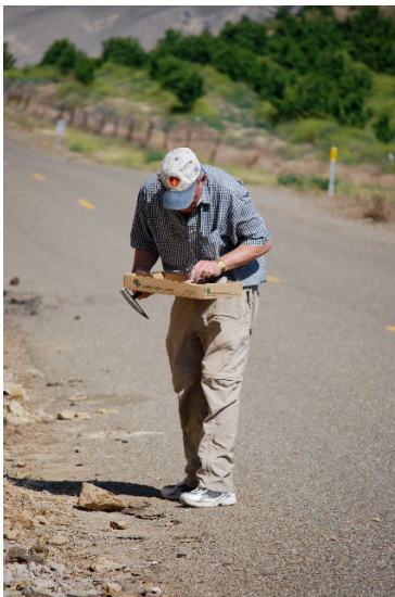
I Should Just Leave This on the Ground!