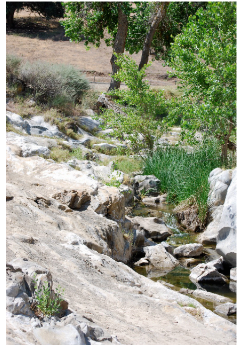
The Green of Del Puerto!