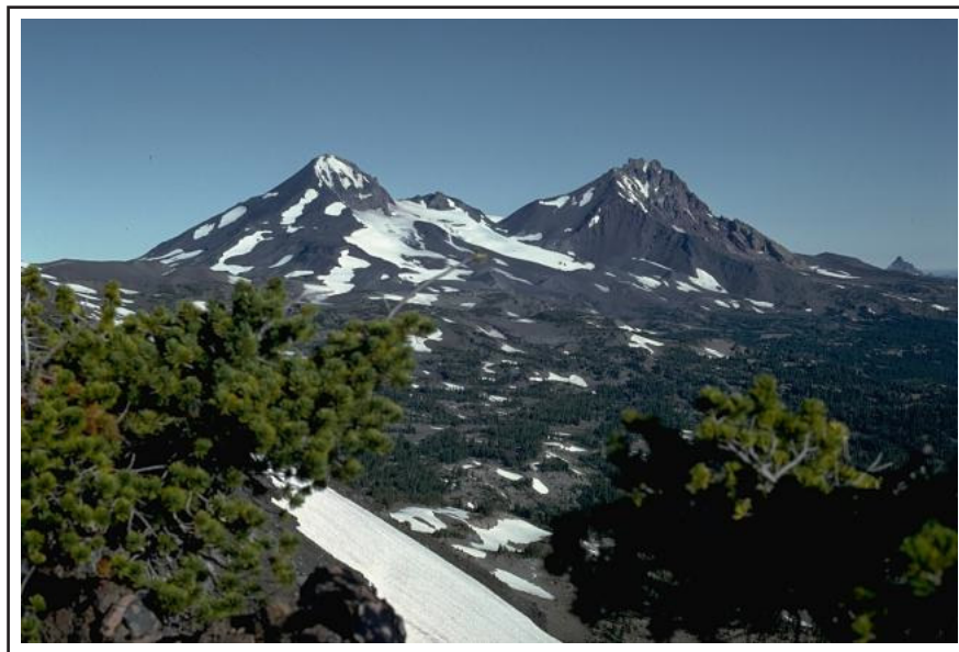
North Sister Field - Oregon Last Eruption - 440 AD +/- 150 years 10,085 feet 44.17° N 121.77° W

Information and Photos from the Global Volcanism Program - Smithsonian Institution.