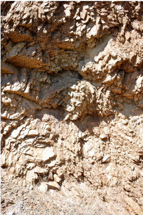
The Brown of Del Puerto!