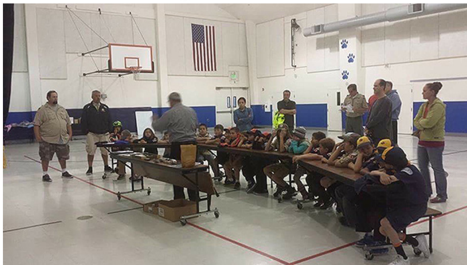
Cub Scout presentation April 10 at Our Savior's Lutheran Church. There were 19 Scouts from Cub Scout Pack 939 and 23 parents.