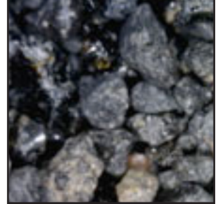
Water Tumbled Lava