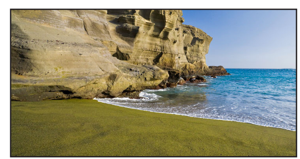
Olivine Sand Beach