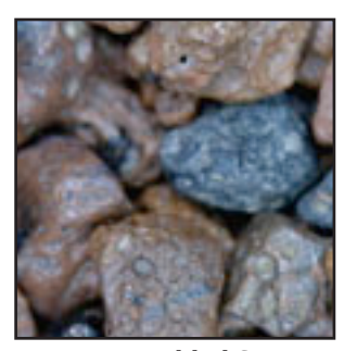
Water Tumbled Scoria