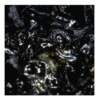
Fresh Glassy Lava

Volcanic sands can come from obsidian type material as at Kilauea or they can be from scoria and be colored black, red or tan. In some parts of the world there are beaches composed of pumice that float on the water. There are also sands formed from the weathering of many other types of volcanic rocks including rhyolites, tuffs, etc.