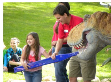
Do You Take Care Of Your Pet? Even A T-Rex Has His Teeth Brushed