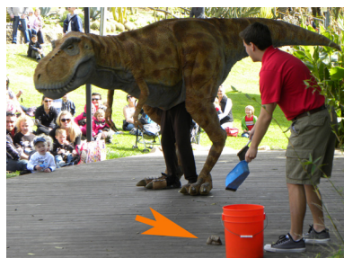
Are You A Responsible Owner? Clean-Up After Your T-Rex