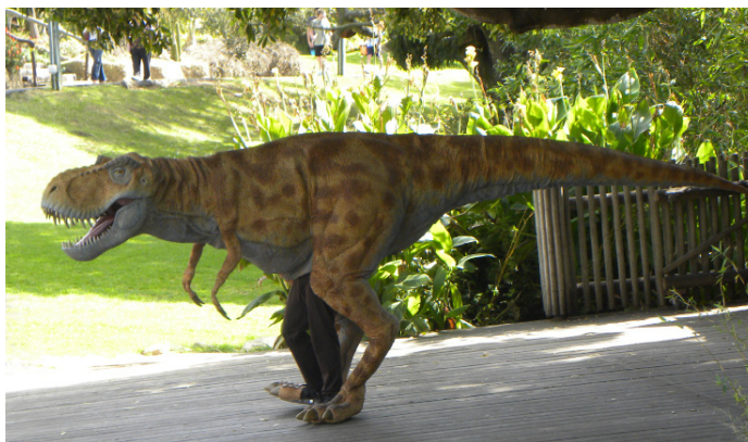
What This T-Rex at the Santa Barbara Zoo Teaches About Having Pets