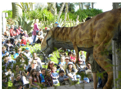
Is Your Pet People Friendly? Who’s Afraid of a T-Rex