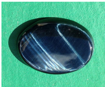
Tiger Eye Cab by Charlie Siders