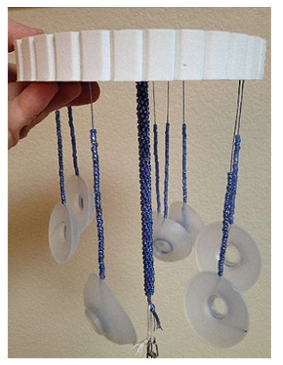
Pat's Kumihimo bracelet in progress