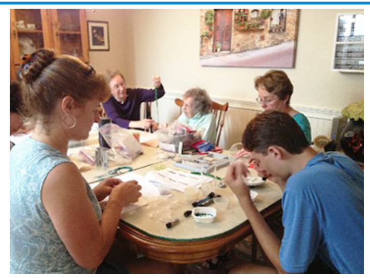
Working on Kumihimo projects