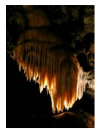
Black Chasm Cavern Photo