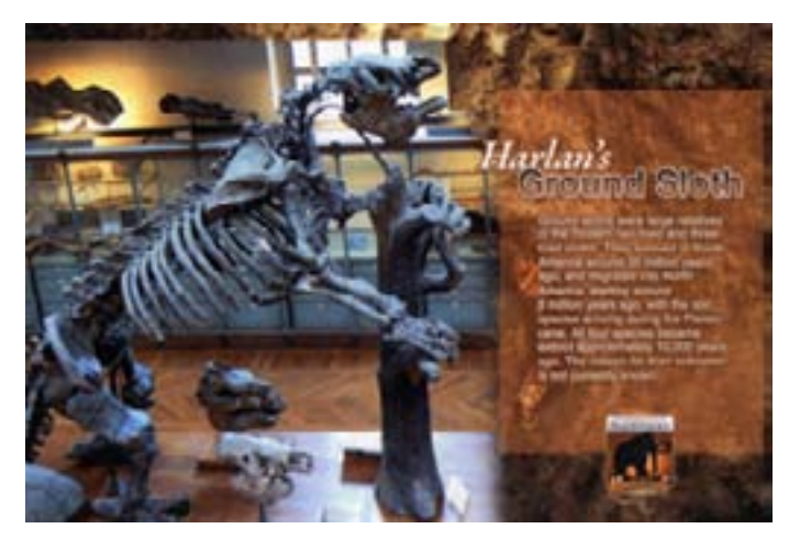
Giant Ground Sloth