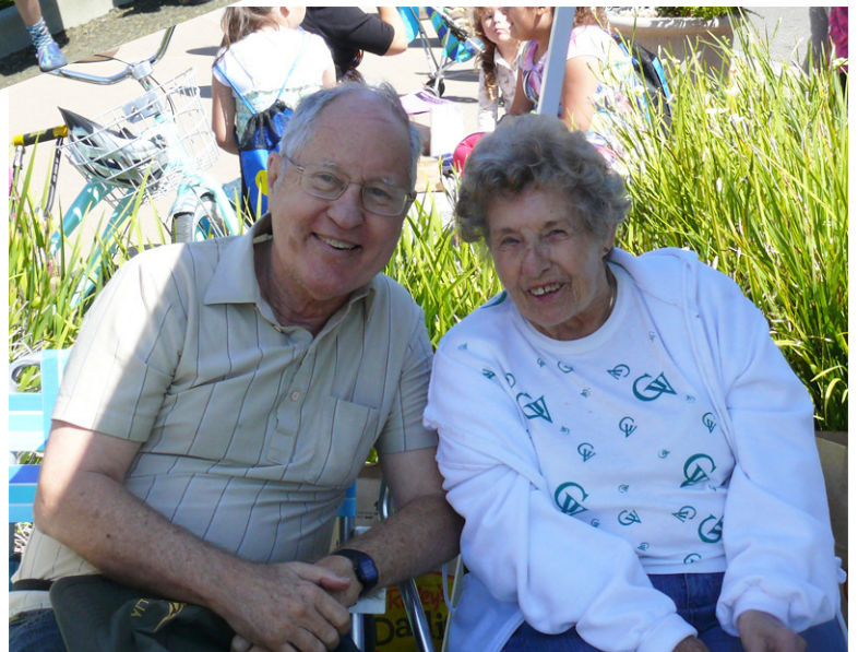
The 'Bosses' "We Sure Have It Made"