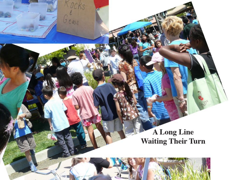
A Long Line Waiting Their Turn