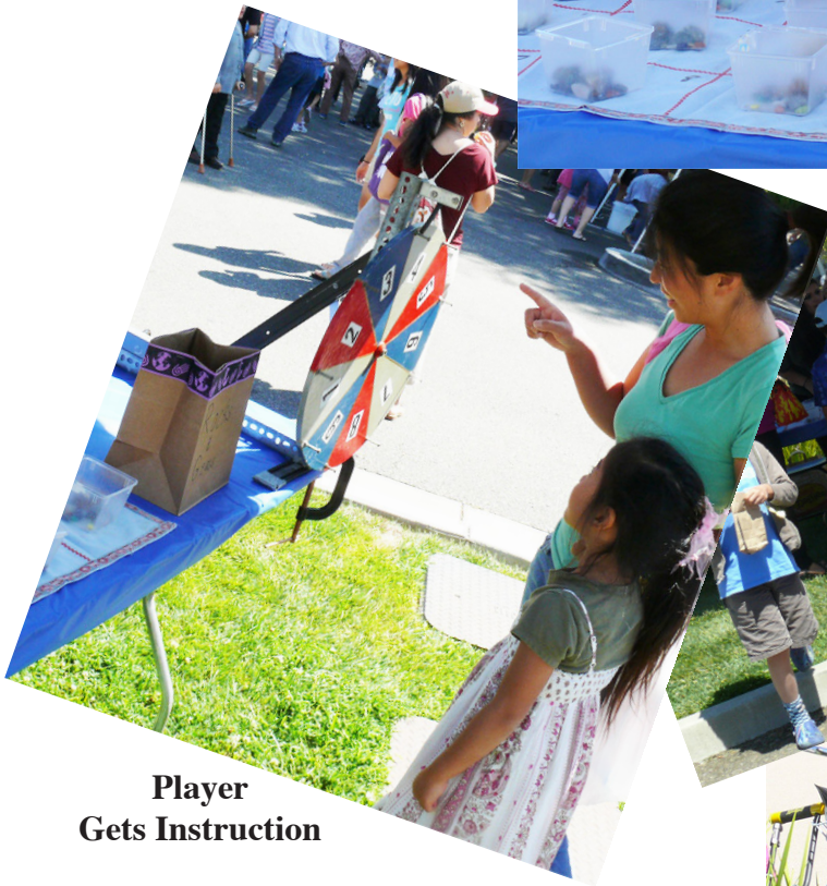
Player Gets Instruction