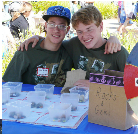
The Workers Pause For A Photo